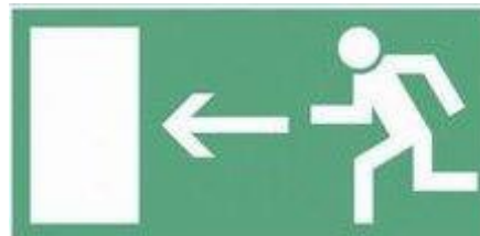
Exit route signage